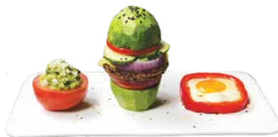
牛油果漢堡三重奏

原隻牛油果切條加上自家製麵包糠，就成一道香脆可口的低脂健康小食。可轉無麩質版本。