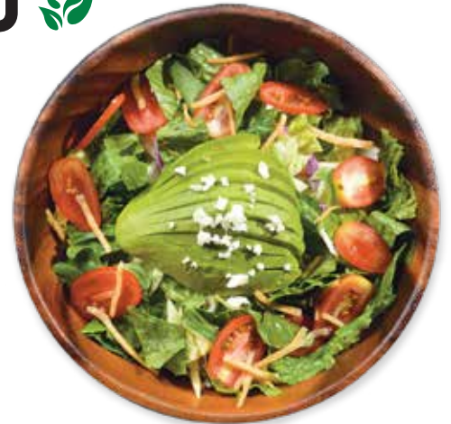
Romaine with Avocado Salad

Fresh Romaine Lettuce with Sliced Avocado and Cherry Tomato; Vinaigrette Dressing.