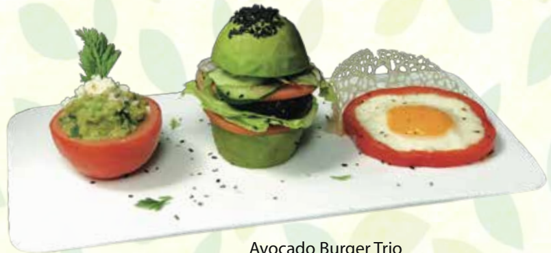
Avocado Burger Trio

Choice of our homemade meat patty or Portabello Mushroom (V). A trio of specialty antojitos with our signature Avocado Burger, Tomato-Guacamole Salad Cup and yummy Fresh Egg.