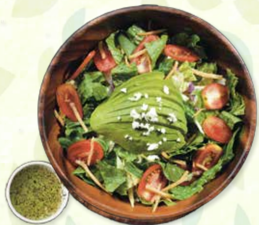
Avocado Romaine Salad